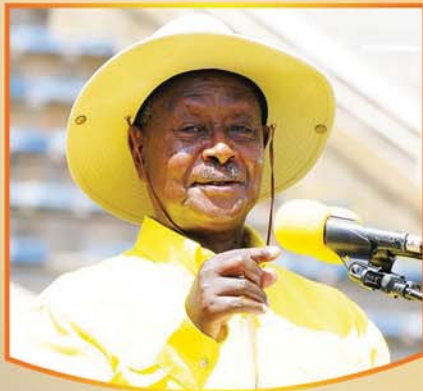
His Excellence Yoweri Kaguta Museveni The President of the Republic of Uganda

The Minister of Internal Affairs Hon. Gen. Jeje Odongo, the Minister of State for Internal Affairs, Hon. Obiga Kania, The Permanent Secretary, Dr. Benon Mutambi and all members of Staff Congratulate H.E. the President of the Republic of Uganda, Gen. Yoweri Kaguta Museveni and join all Ugandans in Celebrating The International Women's Day on 8th March 2019.