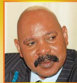
Gen. Jeje Odongo Minister of Internal Affairs:

The Minister of Internal Affairs Hon. Gen. Jeje Odongo, the Minister of State for Internal Affairs, Hon. Obiga Kania, The Permanent Secretary, Dr. Benon Mutambi and all members of Staff Congratulate H.E. the President of the Republic of Uganda, Gen. Yoweri Kaguta Museveni and join all Ugandans in Celebrating The International Women's Day on 8th March 2019.